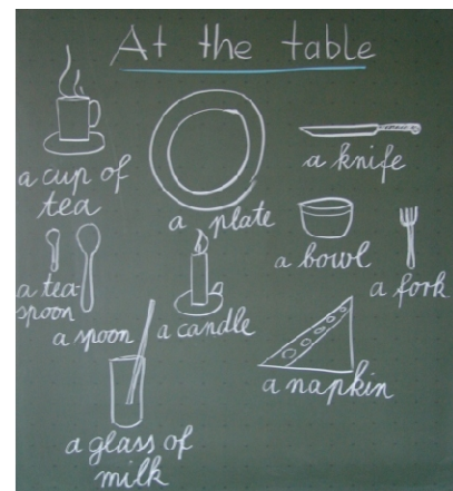
Tafelskizze - Drawings on the Board