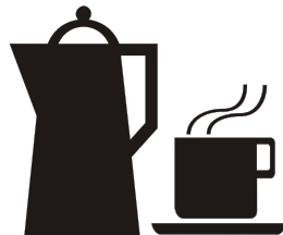
a cup of hot tea