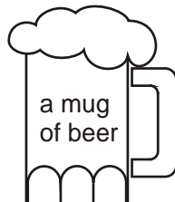
a mug of beer